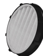
■ Replacement Air Filter