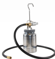
■ 2-Qt. Remote Cup System