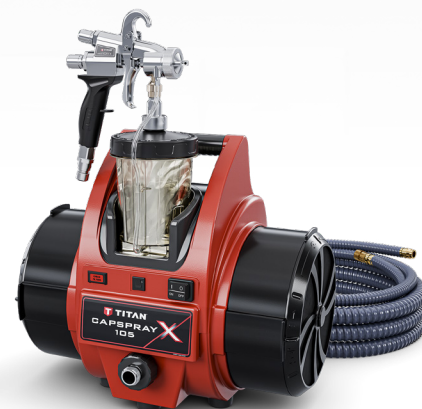
Capspray X 105 w/ Maxum II Gun and CapLiner System